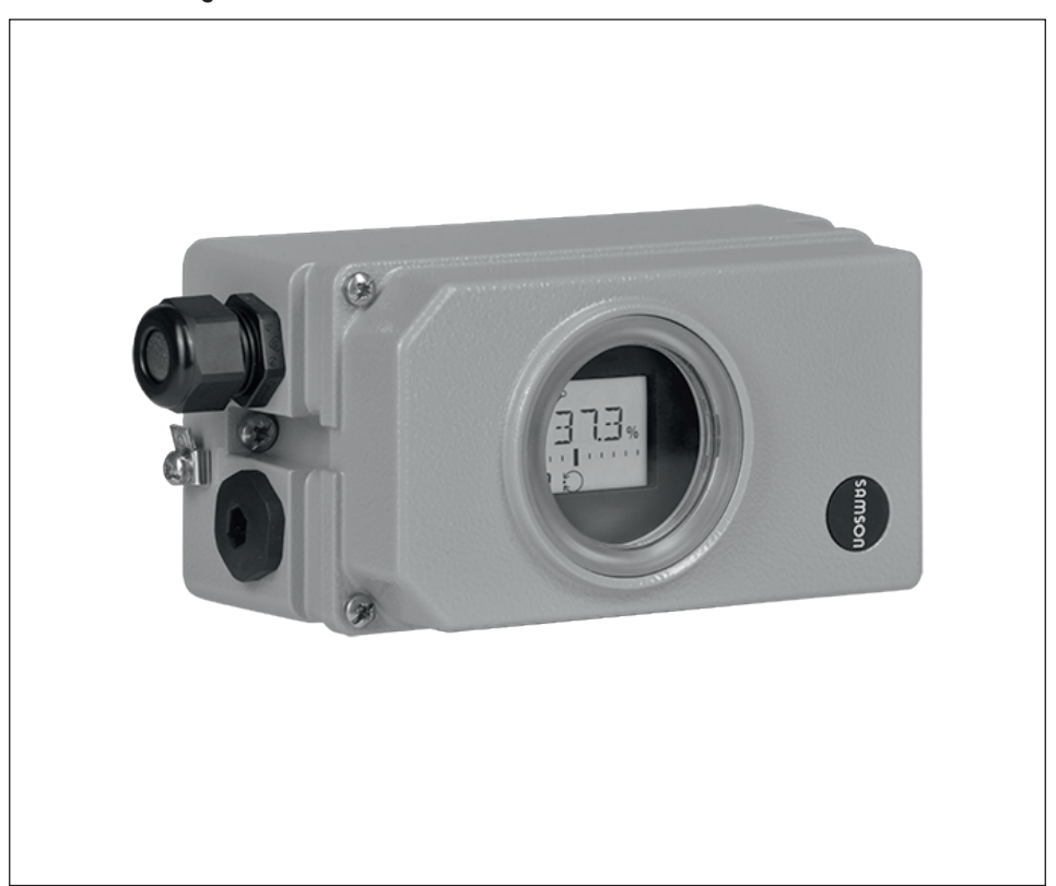
Type 3730-3 Electropneumatic Positioner